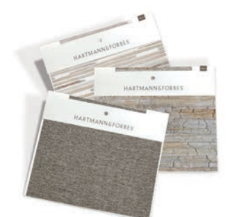
Order Memos Search, filter and select memos

STAY UP-TO-DATE Sign up to hear about product launches, news and updates