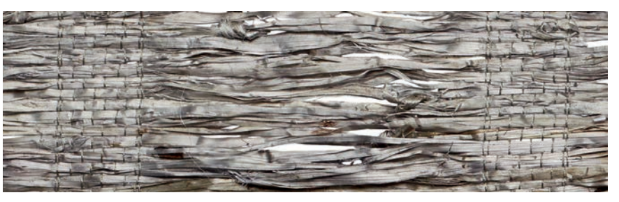
LE1860 Heritage – Armure