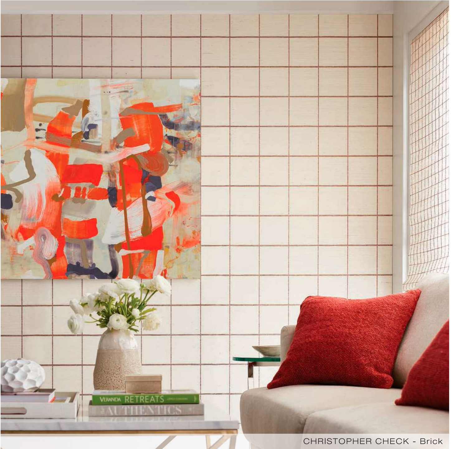
CHRISTOPHER CHECK - Brick