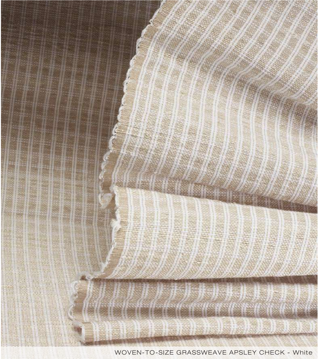
WOVEN-TO-SIZE GRASSWEAVE APSLEY CHECK - White