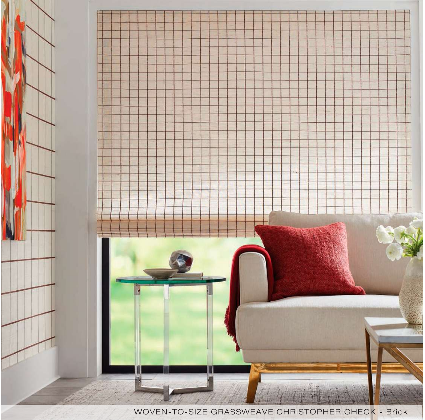
WOVEN-TO-SIZE GRASSWEAVE CHRISTOPHER CHECK - Brick