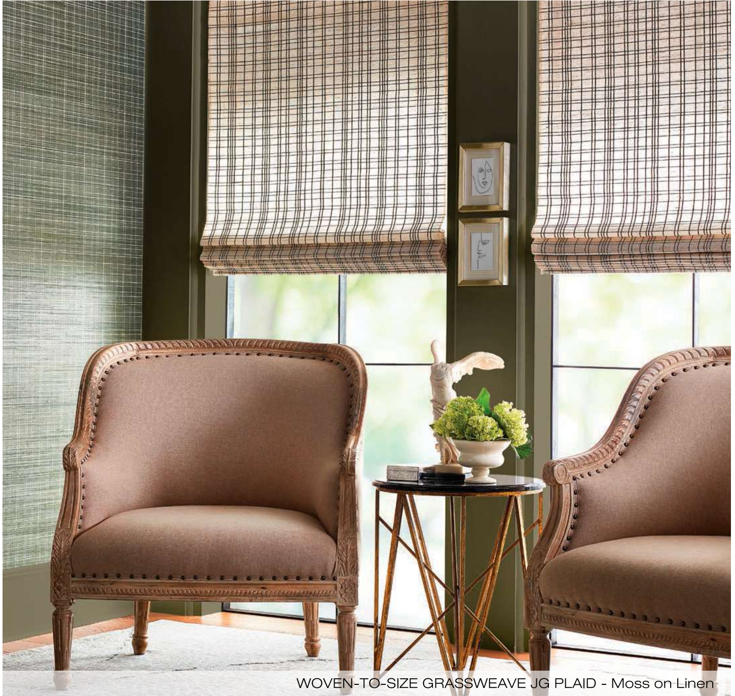
WOVEN-TO-SIZE GRASSWEAVE JG PLAID - Moss on Linen