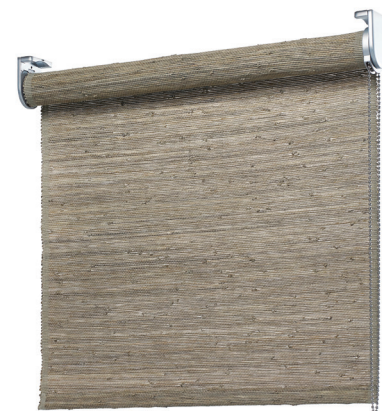
Regular Roll with Clutch