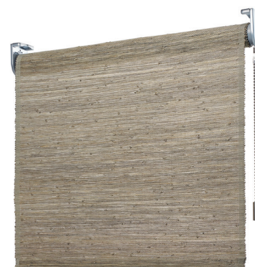
Reverse Roll with Newton