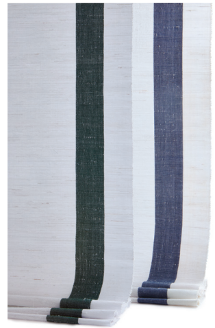
Inset Solid or Striped Edge