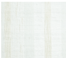
LEAM31-03 Gossamer - Strie Chalk