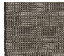
LEAM35-87 Fret - Alloy