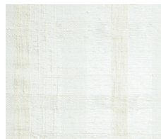
LEAM32-03 Gossamer - Hatch Chalk