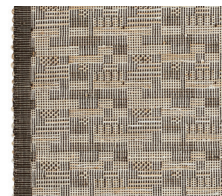
LEAM34-09 Joinery - Newsprint