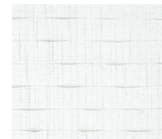
LEAM30-03 Dapple - Parchment