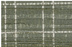
WLJP25-78 JG Plaid Linen on Moss