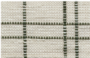
LEJP22-12 JG Plaid Moss on Linen