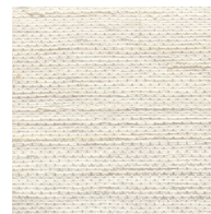
LE1053 Elements – Silesia